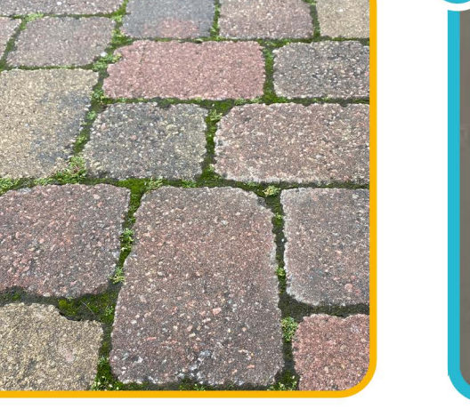
Autumn Woburn blockpaving