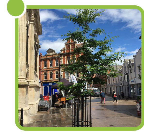
New semi-mature street tree