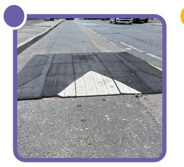
Traffic calming features