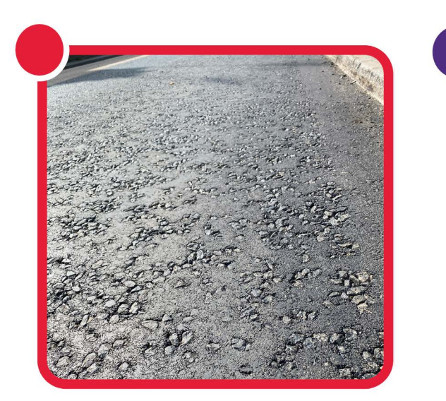
New carriageway surfacing