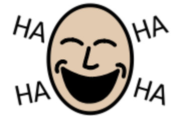
Sense of humour