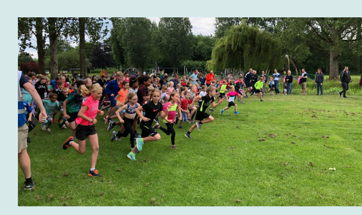
With thanks to Bromsgrove Junior parkrun .

Junior Park Run – A new, free, volunteer led park run for children aged 4-14 will be held at Diglis Playing Fields (Worcester) every Sunday morning. To find out more, please visit junior parkrun.