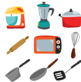
Using, cleaning and storing equipment