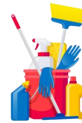
Cleaning and Waste disposal