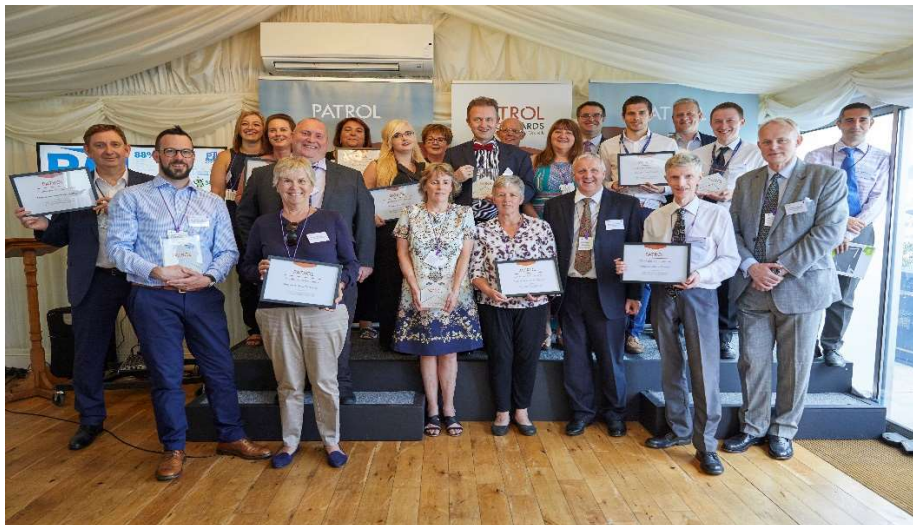
The PARC awards Shortlisted Councils at the House of Commons reception 2019

PATROL has appointed Cheshire East Council to perform the role of Host Authority. The expectation is that services provided to PATROL will replicate the arrangement with an arm's length body, with the Host Authority providing services and advice as required and underpinned by a service level agreement.