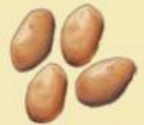
4 Baking potatoes