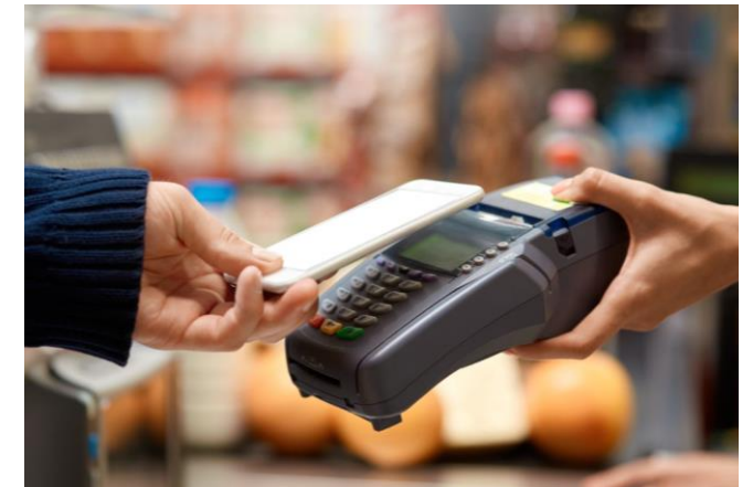
C Allow the customer to scan their electrical device on the reader