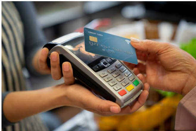
A Allow the customer to scan their card on the reader