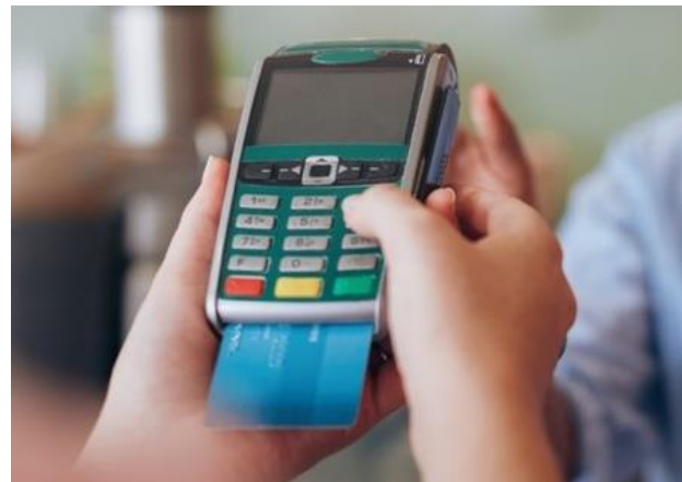
B Insert the card and give the machine to the customer to enter their pin