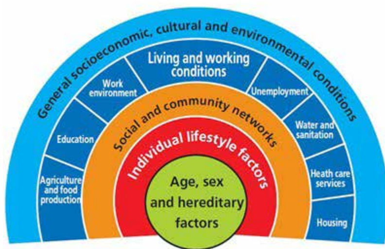
The Determinants of Health (1992) Dahlgren and Whitehead