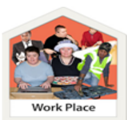
Work Options Group