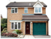
Having a Place to Live