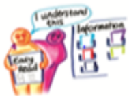
Right Support for Carers