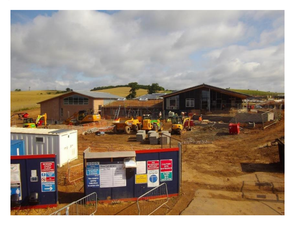
Figure 4: Holyoakes Field First School Construction

3.10 The largest single project part funded by section 106 in this reporting year is £1,123,896 towards the relocation of Holyoakes Field First School, Redditch. The school is moving to a larger site to enable a bigger school to be built to take additional pupils in the future as further housing is built on the west side of Redditch. Figure 4 and 5 below show work in progress on the new school with completion expected in 2022.