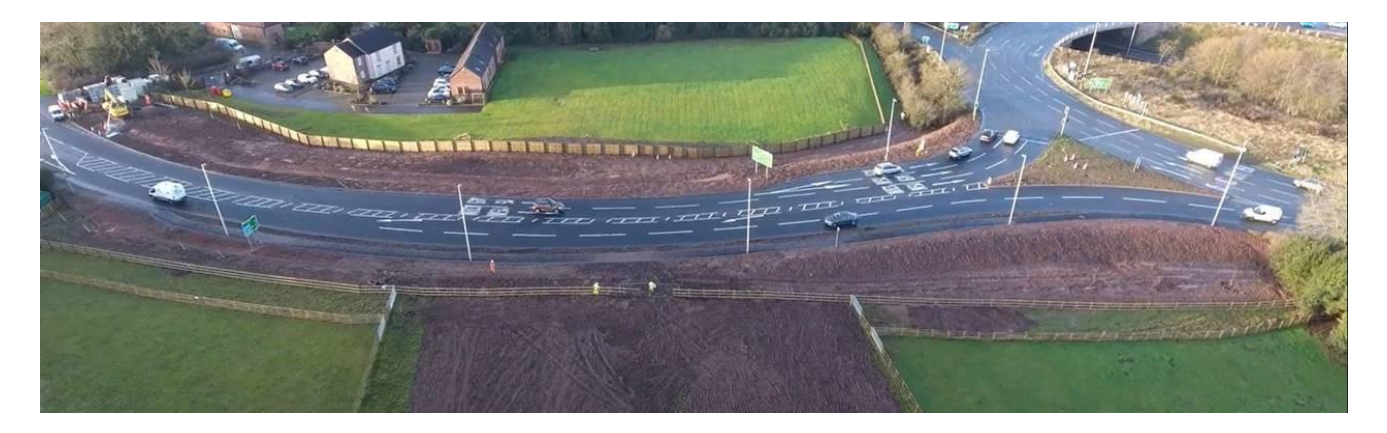
Figure 2 Improvements Completed at M5 Junction 4 (A38)

3.8 Currently the project has finished phase one upgrades as illustrated in Figure 2 and 3 below with further phases planned. Additional information on this critical infrastructure project can be found <u>here</u><sup>6</sup>.