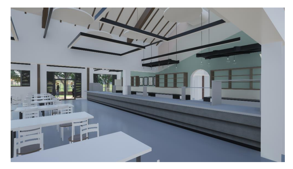
Figure 7: Bishop Perowne High School, Worcester Expansion Internal Concept Design

3.12 WCC also forward funds projects in advance of the receipt of the section 106 contribution. Table 7 shows section 106 funding transferred back to WCC for two completed projects a new primary school at Malvern Vale Primary School, Malvern and a new bathroom management area and special educational needs area at Cherry Orchard Primary School, Worcester.