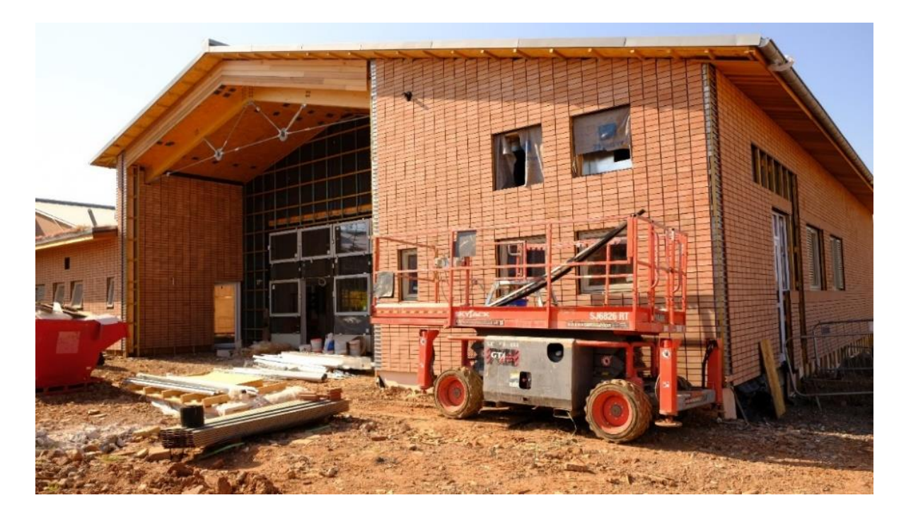
Figure 5: Holyoakes Field First School Construction

3.11 Other notable projects include the start of project to replace the old twin mobile classroom at Honeybourne First School, Honeybourne, Evesham. The old mobile is to be replaced by a new permanent classroom.