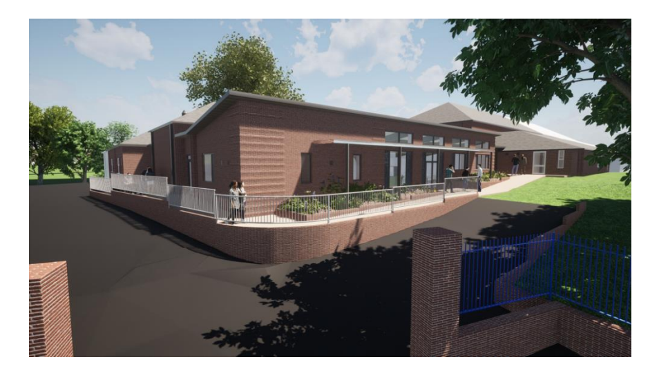
Figure 6: Bishop Perowne High School, Worcester Expansion External Concept Design

3.12 Feasibility work has commenced on proposals to expand Bishop Perowne High School,Worcester by a further 30 places per year group. Concept designs for this project is shown in figures6 and 7 below. These concept design drawings are illustrative of the how the new school buildingscould look internally and externally.