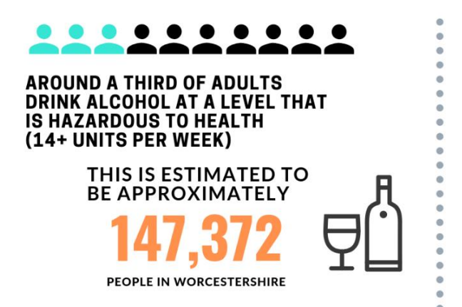
Figure 3. Alcohol: Key Facts

Data sources: Public Health England, www.fingertips.phe.org.uk Graphic created by Public Health Team using Canva