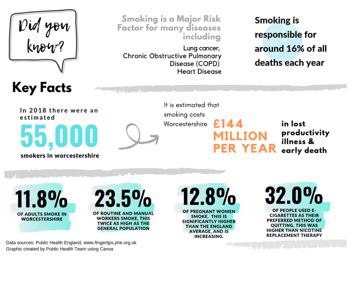
Figure 2. Smoking: Key Facts

Locally, it is estimated that 23.5% of people in routine and manual occupations smoke. This is twice the proportion of all adults estimated to smoke which is 11.8%.