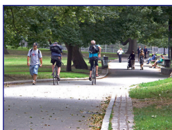
* Examples of good practice