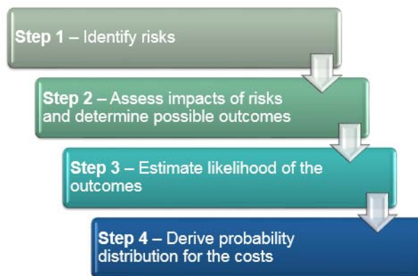
Figure – Steps in QRA

Step 1 is identification of all risks affecting the project through risk workshops and risk reviews, resulting in a risk register. Risk workshops typically include a mixture of expertise such as engineers, designers, cost consultants, procurement specialists, and environmentalists.