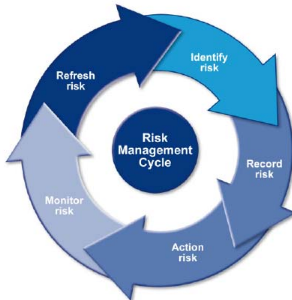
The Risk Cycle

Our risk management commences at the initial stage of the project with the identification and assessment of risks in terms of their likelihood and associated cost outcomes, and follows a cyclic process as shown below.