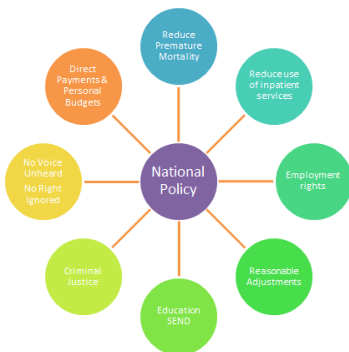
Figure 1 Key Policy Areas 4

NHS England, in conjunction with the government, have established programs to improve treatment and outcomes in relation to health. More specifically, in 2015 a national review programme of premature deaths in people with learning disabilities was commissioned, this is covered in more detail later in this briefing.