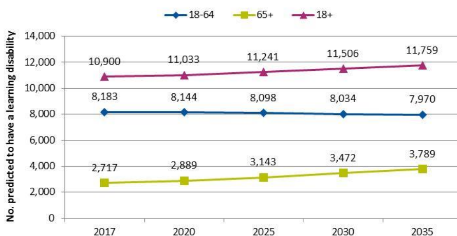
Figure 3 Total Number of people estimated to have a Learning Disability in Worcestershire (2017-2035)

Population projections carried out by Oxford Brookes University and the Institute of Public Care, estimate that overall there will be an increase of individuals with a learning disability from, as shown in Figure 3, 10,900 in 2017 to 11,759 in 2035, which is 859 in total. In the 18-64 year old age group, numbers are expected to fall from 8,183 to 7,970 individuals living in Worcestershire with a Learning Disability. In contrast to this there is projected to be an increase of individuals living with learning disability from 2,717 to 3,789 in the 65+ age group. This trend is also observed when looking at numbers of individuals by type of learning disability, as shown in Table 3.