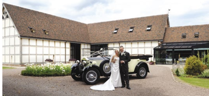
AE Wedding Photography