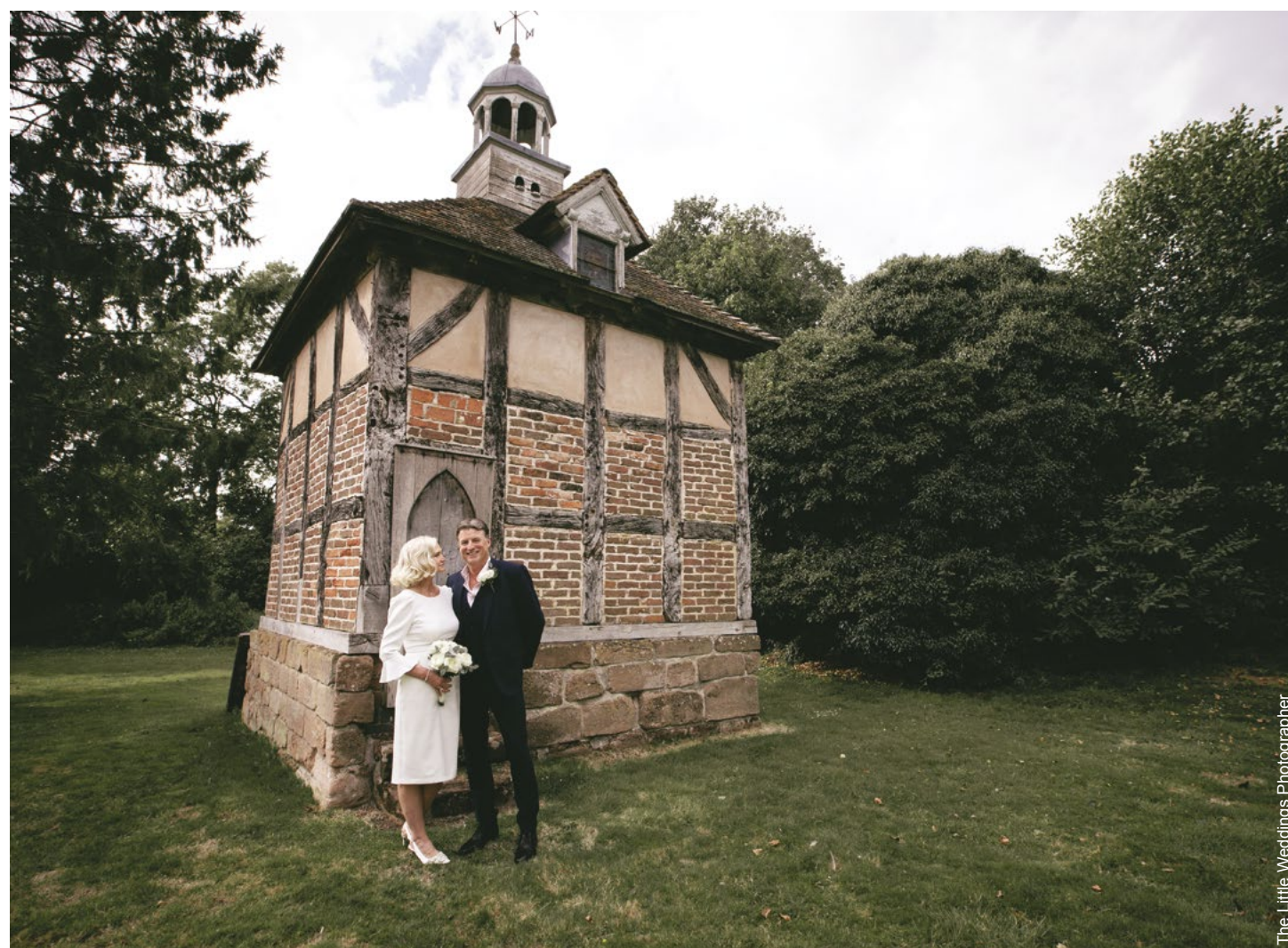
The Little Weddings Photographer