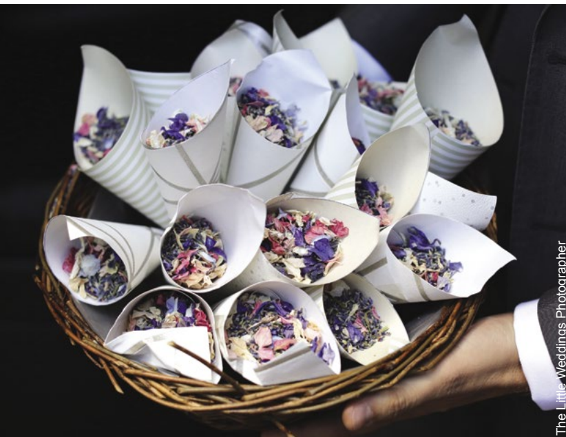
The Little Weddings Photographer