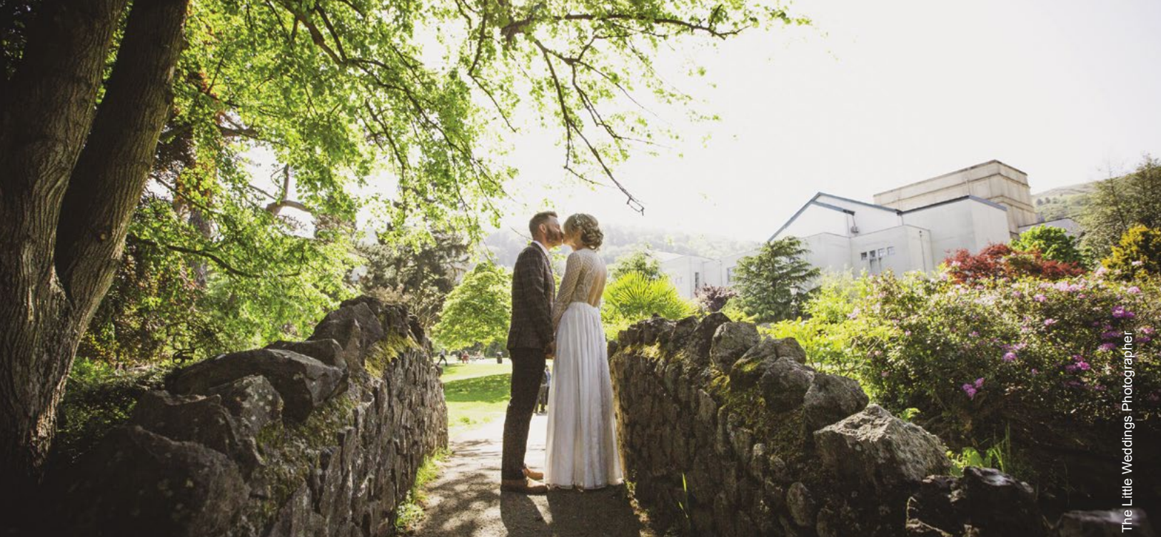
The Little Weddings Photographer