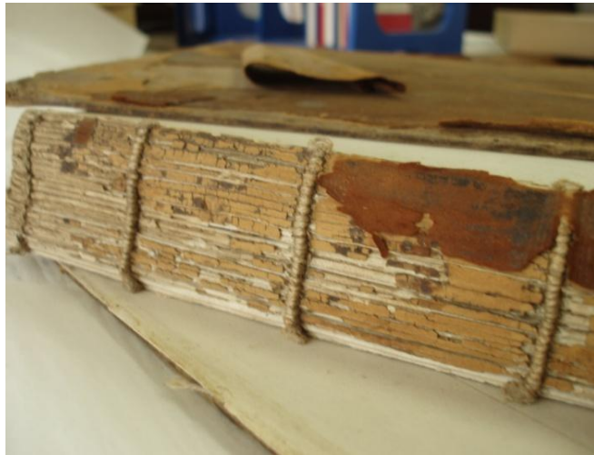
Left and bottom left: Water-damaged volume. Above and below: Wear-and-tear to the binding.

The mould damaged cover could not be saved, but the damaged inner pages were cleaned and strengthened with acid-free paper. The Frankpledge volume now has its own drop-box protective storage. The volume had contained smaller folios bound into one volume, but after cleaning and de-compressing the pages, it was decided to keep the individual folios separate acid-free folders. The original cover and bindings have been retained.