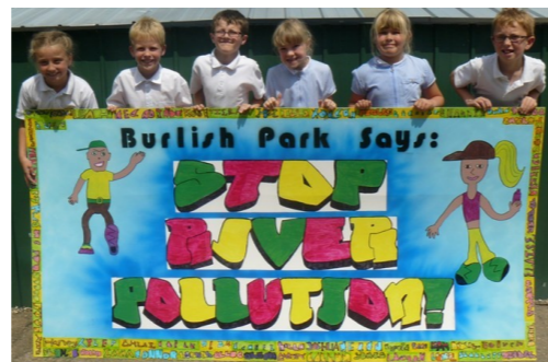
Burlish Park Primary School