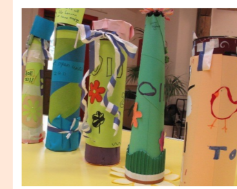
Fantastic time capsules!

The scene was set for the timecapsule workshop by inviting children to explore a 'timecapsule' from 200 years ago- this included objects, poetry and messages from a time when people were very excited about innovations and hopeful about changing the world for the better. During the workshop children worked in small teams to create their own timecapsules, and were challenged to think and discuss about what objects, pictures, messages about the world, new inventions and innovations would go inside their capsules in 2011.