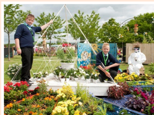
Parkside Middle School