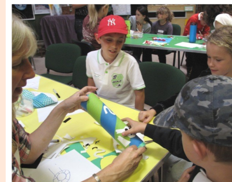
Feckenham First School, making their time capsule

Over 280 children, young people and staff greatly enjoyed this years Worcestershire Eco-Schools conferences, ran by the Learning for Sustainability Team at Bishops Wood Centre. Participants took part in three great workshops this year; a fantastic Earth Walk (led by Bishops Wood staff) a Sharing workshop and a creative Timecapsule workshop. A specific teacher workshop was also held to explore extending Eco-Schools work.