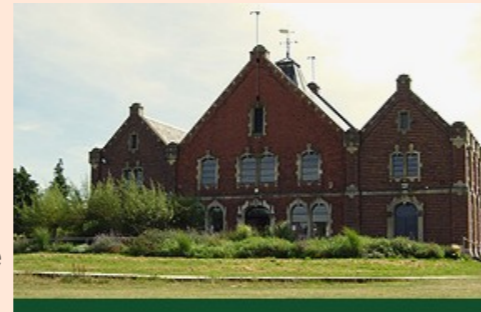
The Pump House, Worcester