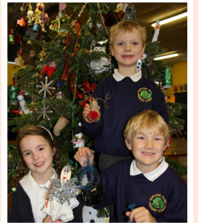
Children from Burlish Park Primary School

Youngsters from Burlish Park Primary School and Tardebigge First School came top of the class for the best dressed tree winning the top prize of £100 and £150 respectively. Charford First School scooped a recycling stationary pack prize for their Christmas Tree entry. Burlish park also won the top £100 prize for another best decorated tree competition, sponsored by Barnett Hill Nursery, Stourbridge. Competition money will be spent on environmental projects in the schools!!