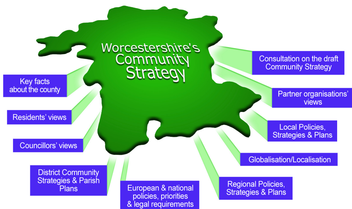
Figure 1 – The information that shaped Worcestershire’s Community Strategy

The diagram below illustrates the many sources of information and evidence that have shaped this strategy. These are further explained in this section and in Section 3.