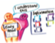
Right Support for Carers