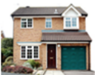
Having a Place to Live