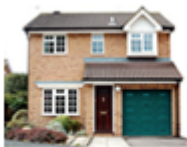
Having a Place to Live

We continue to work together to improve the quality of AHC