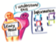
Right Support for Carers

No meeting has taken place since the last Partnership Board because it had to be cancelled. A highlight report will come to the November Partnership Board.